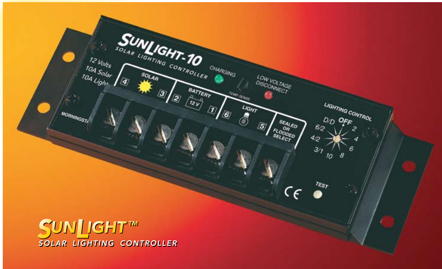
SUNLIGHT™ SOLAR LIGHTING CONTROLLER

Morningstar's advanced SunLight solar lighting controller combines the SunSaver design with a microcontroller for automatic lighting control functions.